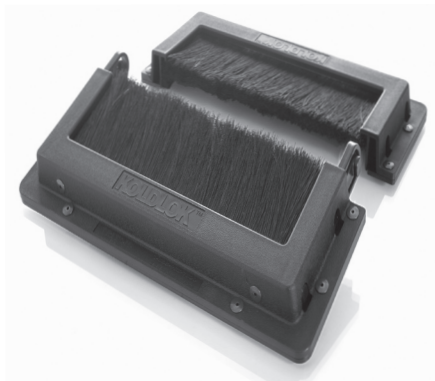
Item No. 2020