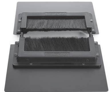
Item No. 2040